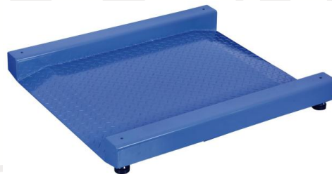
Mild steel low profile drum scale