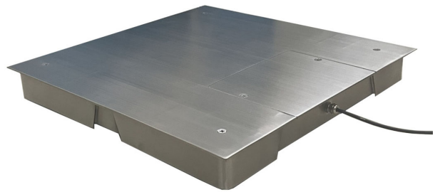
Stainless steel smooth plate deck