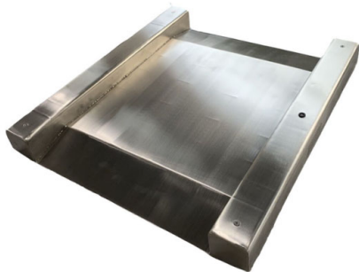
Stainless-steel low profile drum scale