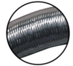
Heavy-duty metal cable with water-proof protective outer coating